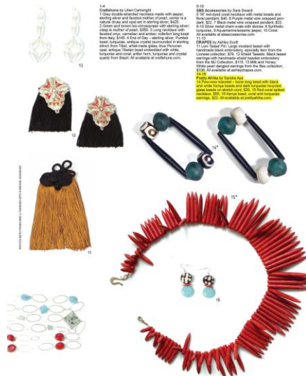
Me In Focus Magazine, September 2010